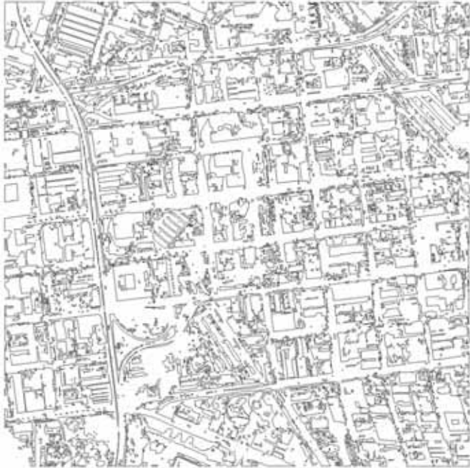
Art on Main Google Earth Trace